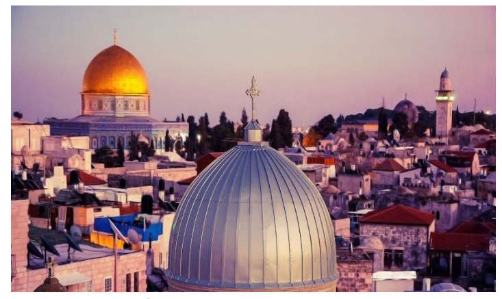
February 19-28, 2024