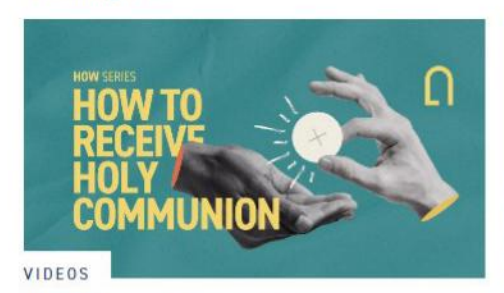
How to Receive Holy Communion