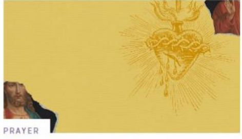
Living the spirituality of the Sacred Heart 350 years later