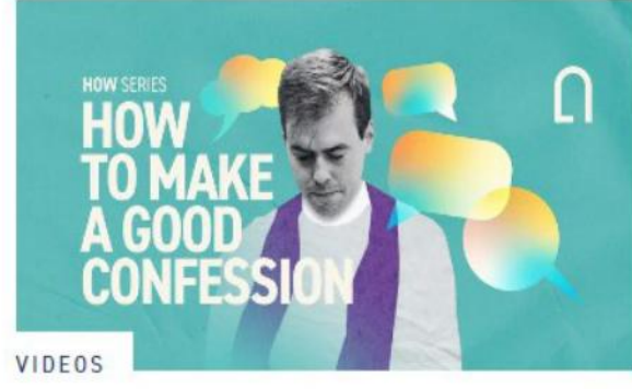
How to make a good Confession