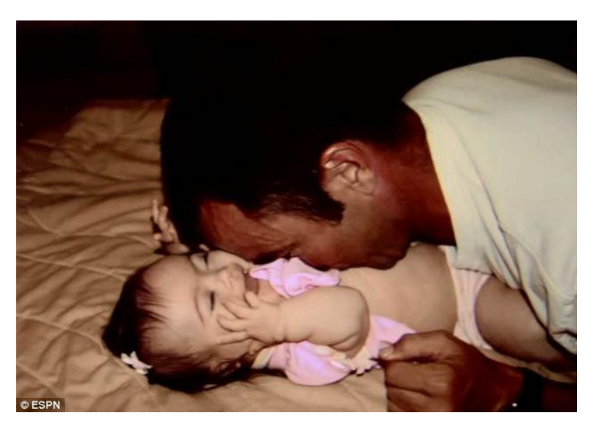
Realization: But he said when she was a few months old, he tickled her and she laughed and pushed back - and he realized she was like every other kid. 'She's my kid,' he said