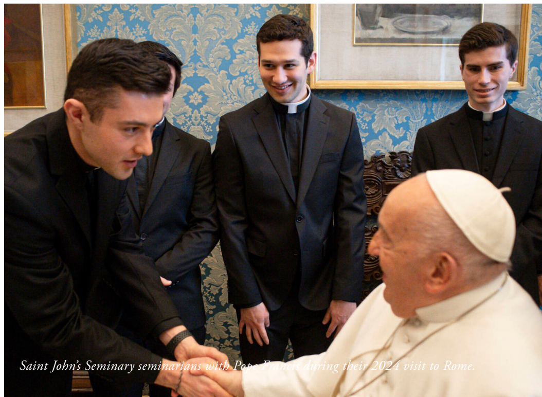
Saint John’s Seminary seminarians with Pope Francis during their 2024 visit to Rome.

Stay tuned to the SJS Podcast for more stories about how Pope Francis has inspired our seminary community.