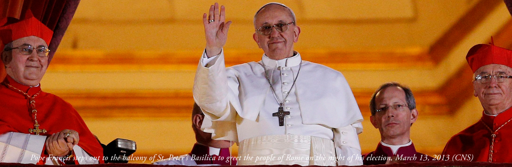
Pope Francis steps out to the balcony of St. Peter's Basilica to greet the people of Rome on the night of his election, March 13, 2013

The passing of Pope Francis (1936–2025) marks the end of a historic and deeply pastoral pontificate — one defined by humility, mercy, and a relentless call to bring Christ to the margins of society.