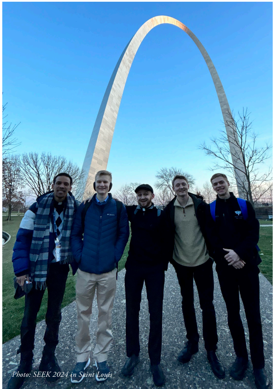
Photo: SEEK 2024 in Saint Louis