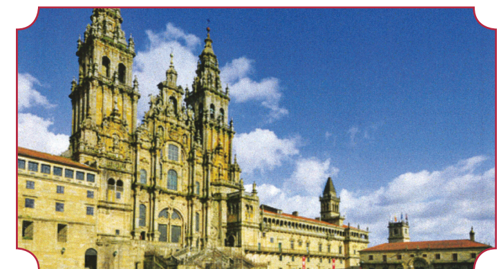
Santiago de Compostela Cathedral