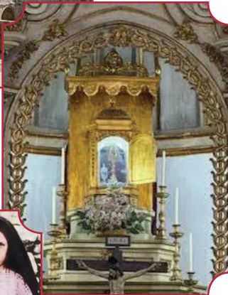
Santarém, Eucharistic Miracle