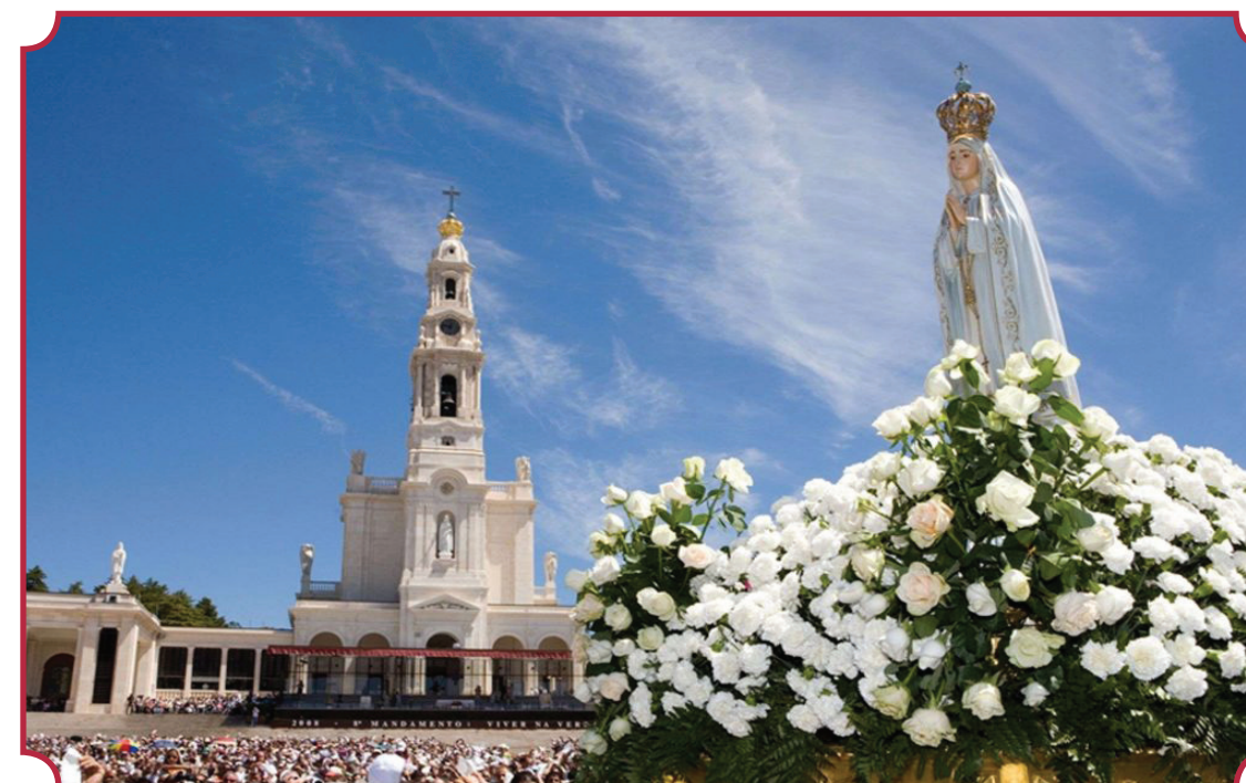
Sanctuary of Our Lady of Fátima