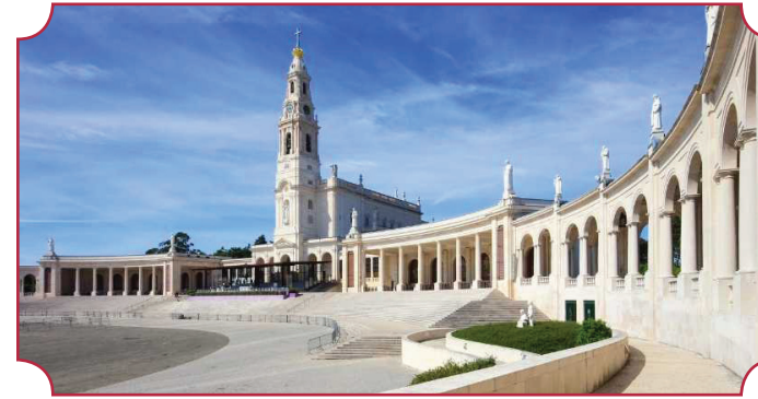
Our Lady of Fátima Shrine