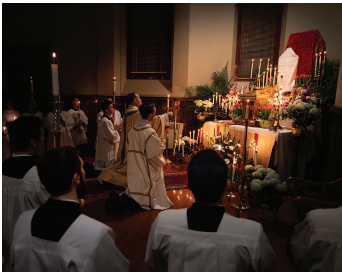
SAINT JOHN'S SEMINARY

Of those who graduated from the M.A.M. and M.T.S. programs in May 2023, all five graduates, or 100%, reported that they were working in their chosen area of ministry or field of employment.