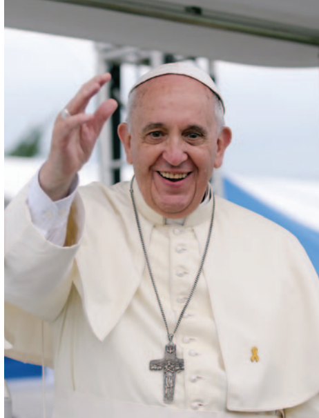
His Holiness Pope Francis