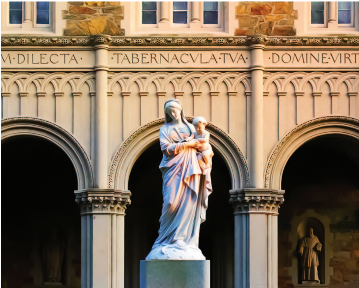
SAINT JOHN'S SEMINARY