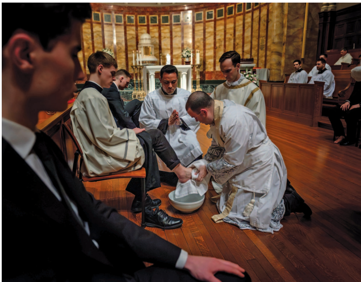
SAINT JOHN'S SEMINARY

Year Two of this new curriculum will be offered in academic year 2025–2026.