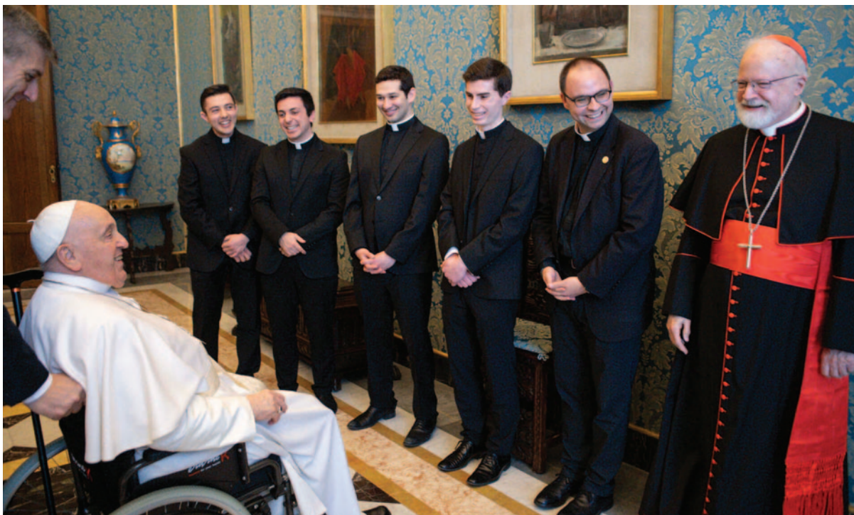
SAINT JOHN'S SEMINARY