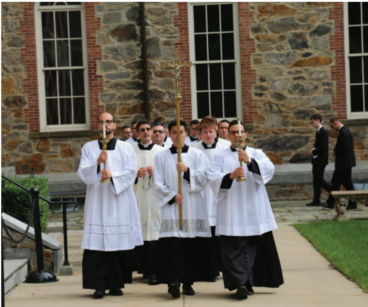
SAINT JOHN'S SEMINARY

Saint John's Seminary offers seminarians optional Student's Accident and Sickness Medical Expense Insurance. Information is available through the Business Office.