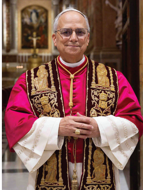
His Holiness Pope Leo XIV