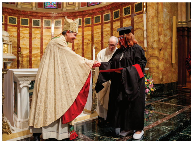
SAINT JOHN'S SEMINARY

TH551 Ecclesiology (3) ST500 Liturgy and the Sacraments (3) Elective (3) Year B Formation Colloquium (1)