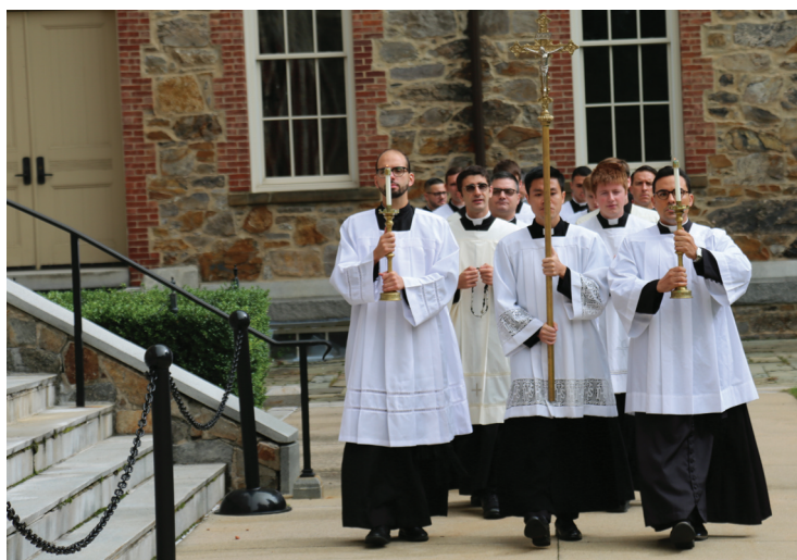
SAINT JOHN'S SEMINARY

Information regarding the Summer 2026 courses will be made available during the Spring 2026 term.