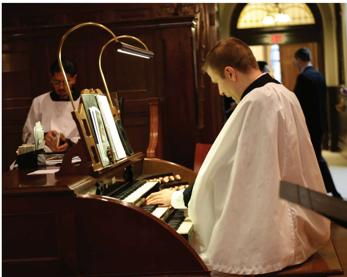
SAINT JOHN'S SEMINARY