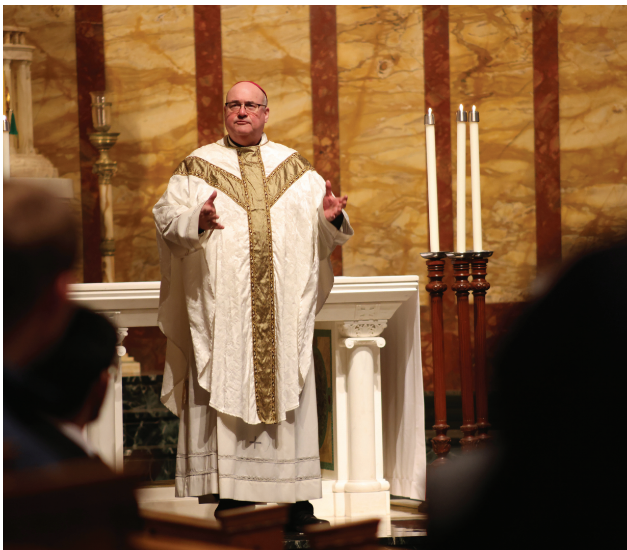
SAINT JOHN'S SEMINARY

PH403 Epistemology (3) PH404 Faith and Reason (3) PH406 Political Philosophy and the Family (3) PH424 Contemporary Philosophy (3) TH405 Apologetics and Dialogue (3)