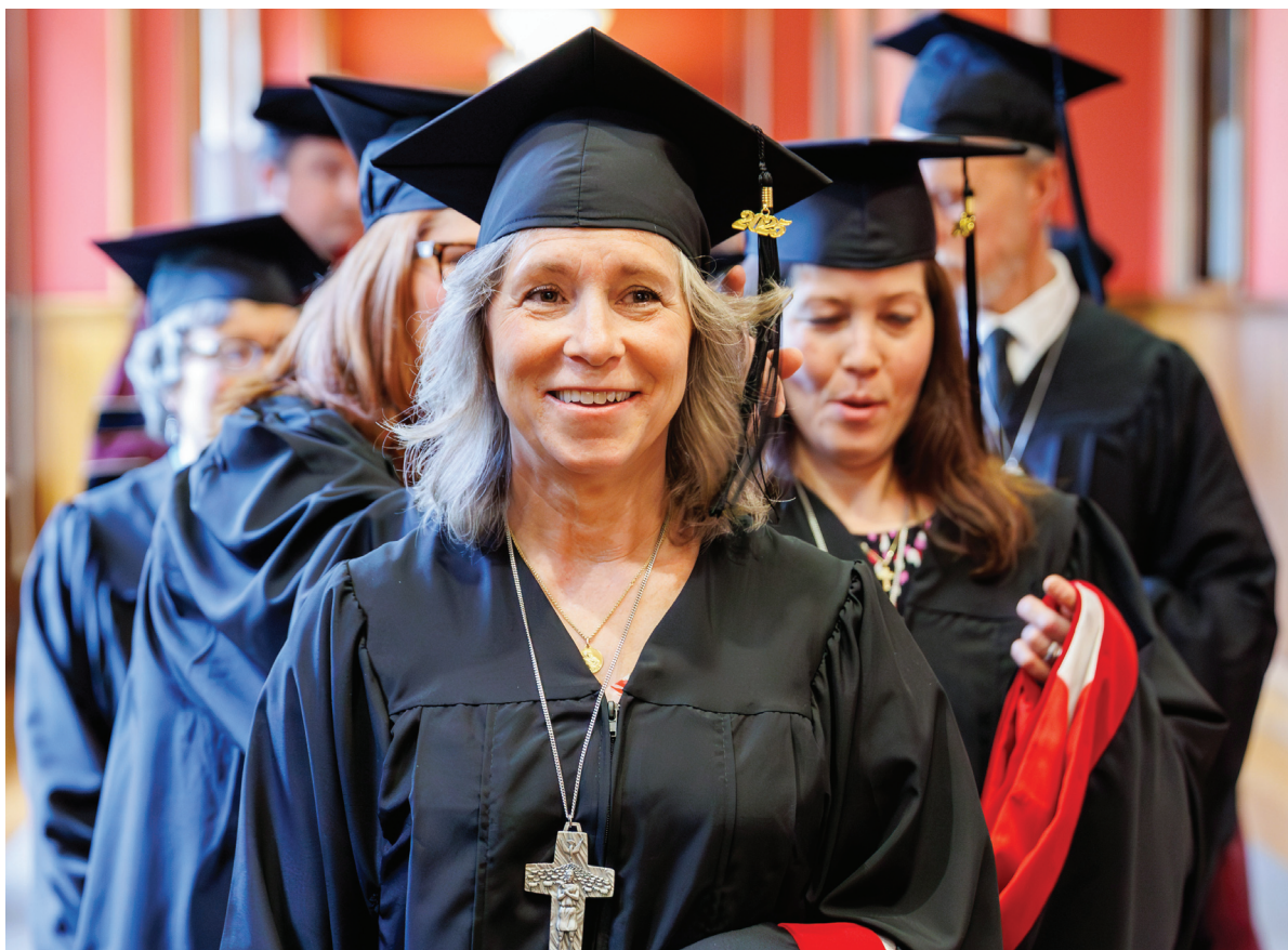
SAINT JOHN'S SEMINARY

Periodically, a written formation advising form, reflecting on the progress of the student, must be filled out and signed by the formation advisor. In the two years of apostolic formation, the field education supervisor, following consultation with the student, is also required to submit evaluations to the Director of Field Education.