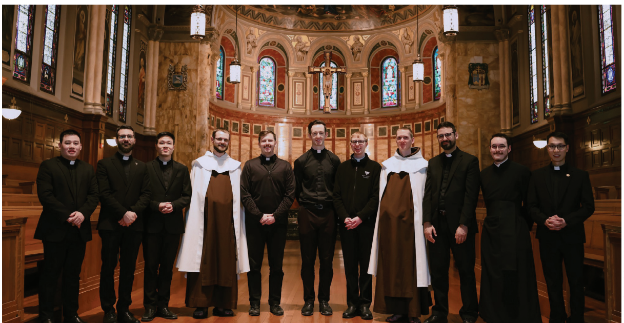
SAINT JOHN'S SEMINARY