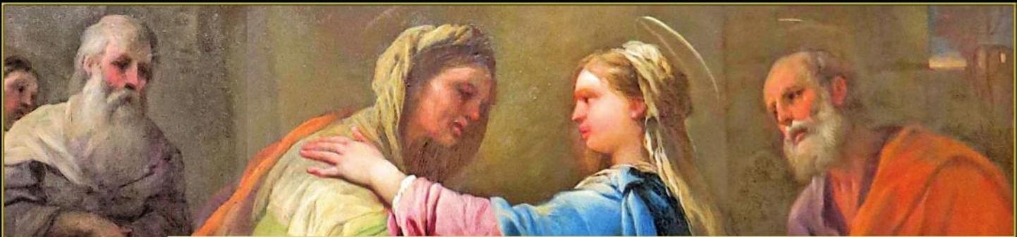
The Visitation (1696) - Luca Giordano

JOY He will baptize you with the Holy Spirit. Lk 3:16